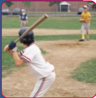
Attendees receive instruction on hitting, fielding, base running and game strategies.